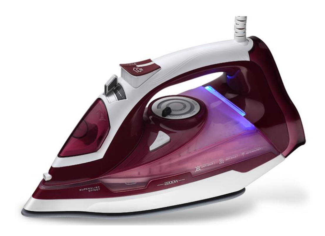
14755 RUSSELL HOBBS STEAM, SPRAY, DRY IRON