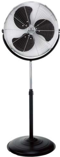
MODEL: RHHV45 HIGH VELOCITY PEDESTAL FAN