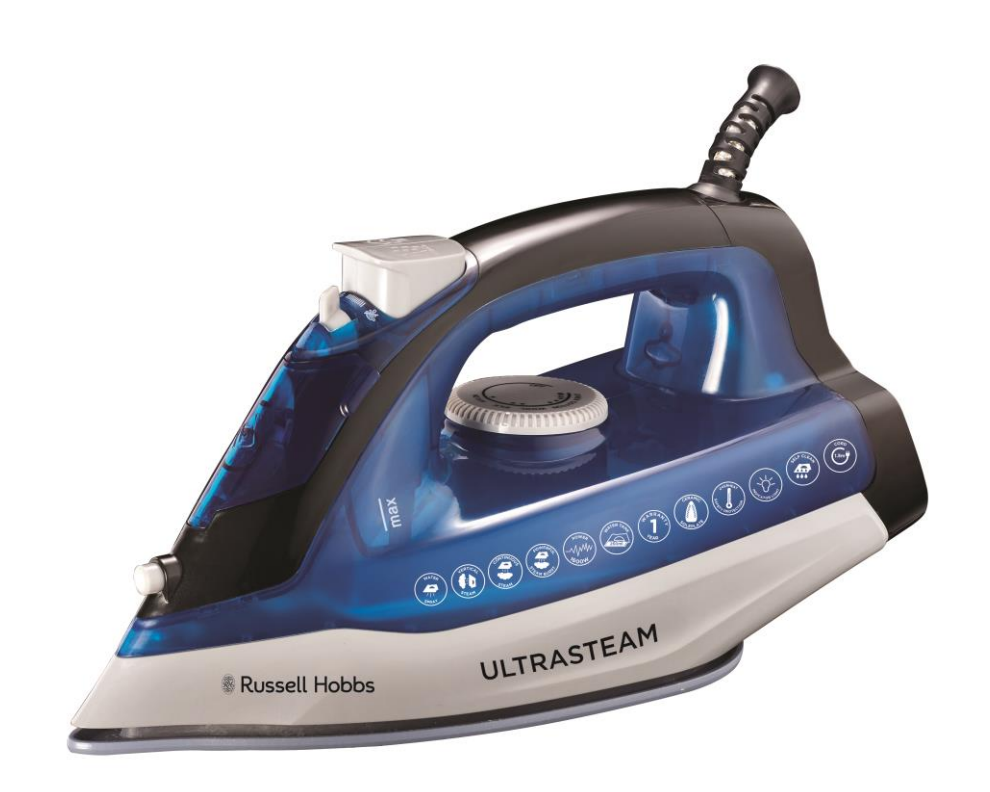
RHI614 RUSSELL HOBBS STEAM, SPRAY, DRY IRON