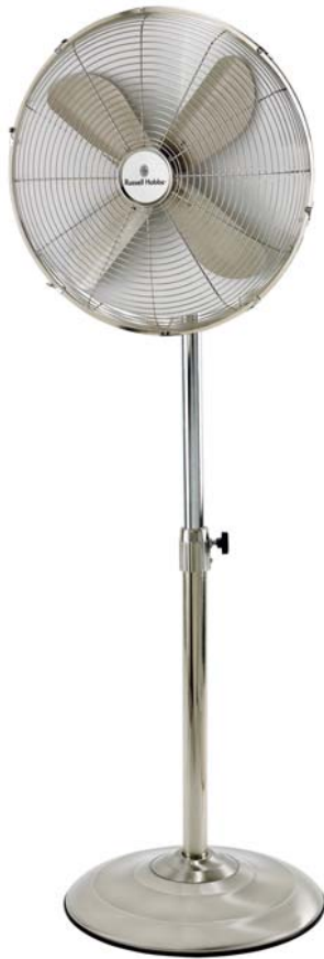
MODEL: RHPF-40 RUSSELL HOBBS PEDESTAL FAN